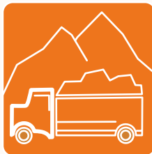
Resource use minerals and metals