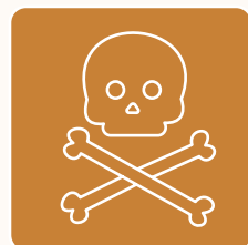
Human toxicity, noncancer