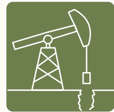
Resource use fossils