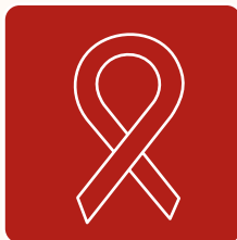
Human toxicity, cancer