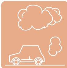
Photochemical ozone formation